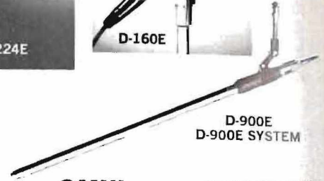
D-900E D-900E SYSTEM